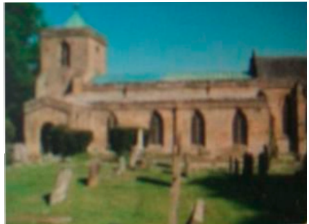
St Bartholomew's Church he would have attended