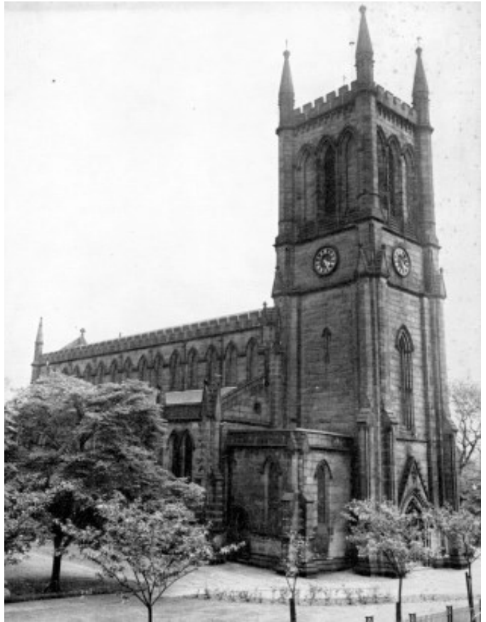
The South-West Corner